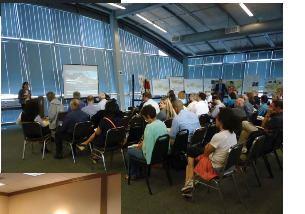
Community Workshops 2013