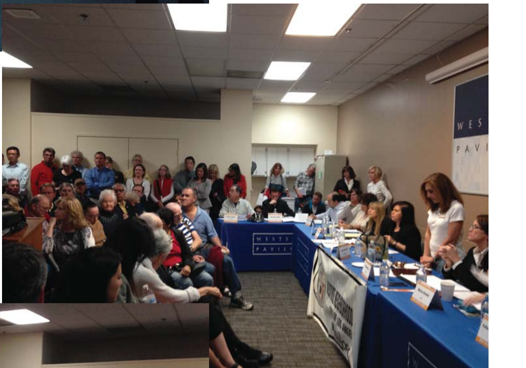
Neighborhood Council Meetings 2014