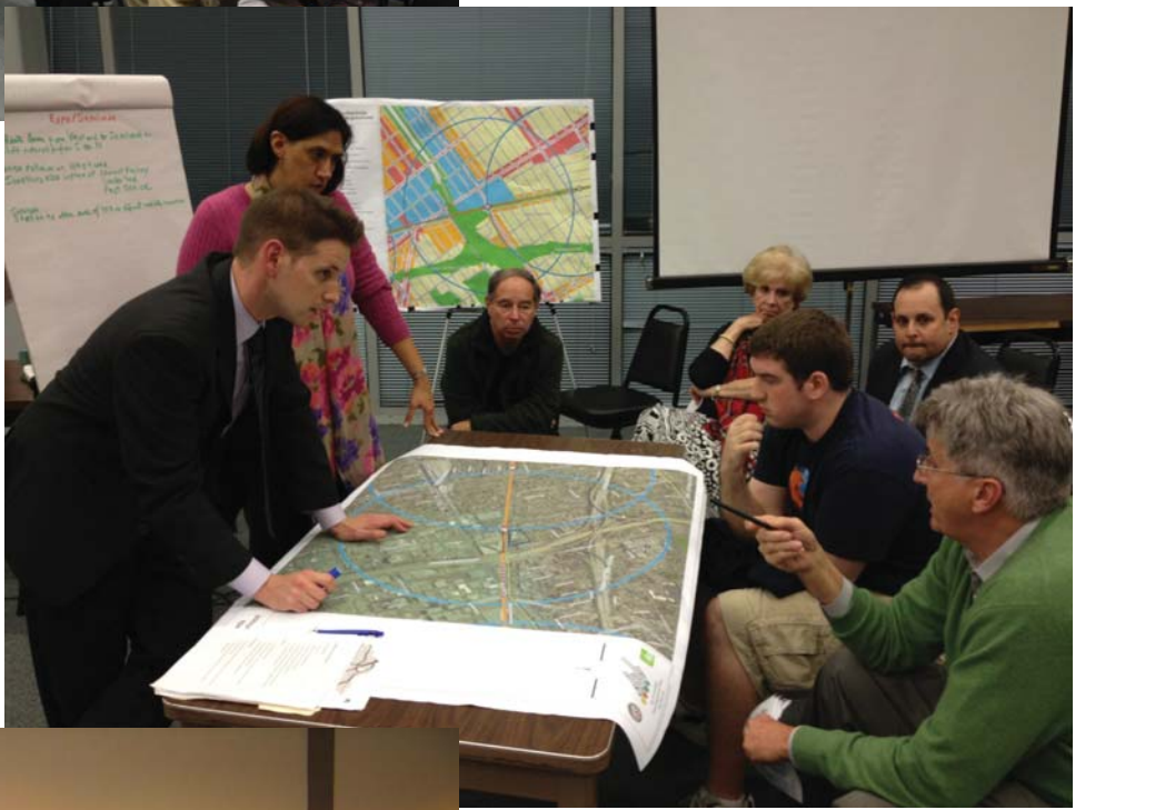
Scoping Meeting 2013