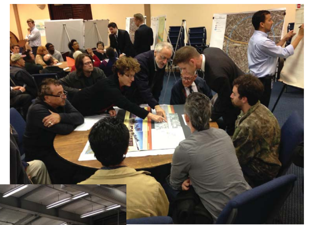
Community Visioning 2012