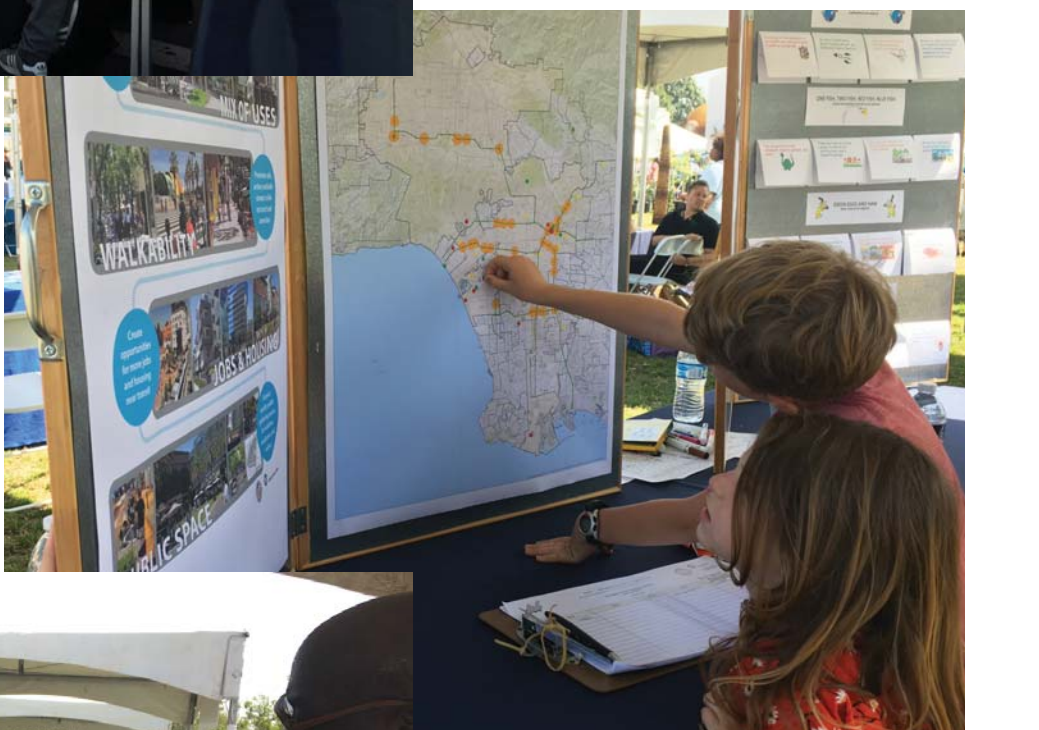
Earth Day Booth 2017